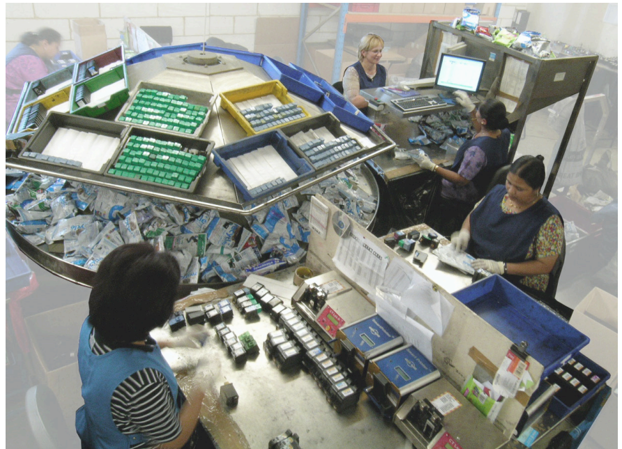
Custom workstation assists operators in sorting 20,000 cartridges / day.

Photo by courtesy of our client, thank you.