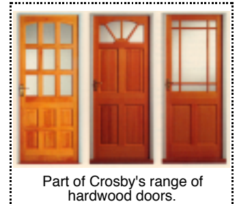
Part of Crosby's range of hardwood doors.